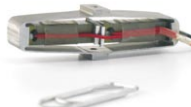
Figure 4.9: View of the APA 400M Actuator

Available option(s): SG, VAC Available interface option(s): FI, H, TH, FF, SI