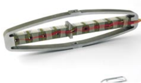
Figure 4.13: View of the APA 1000XL Actuator

Available option(s): SG, VAC Available interface option(s): FI, H, TH, FF, SI