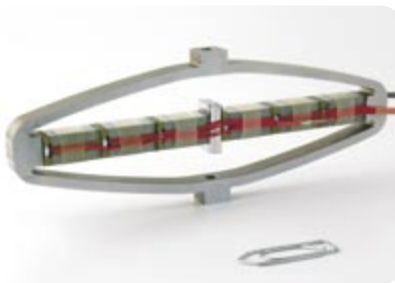
Figure 4.12: View of the APA 500L Actuator

Available option(s): SG, VAC, HT, NM Available interface option(s): FI, H, TH, FF, SI