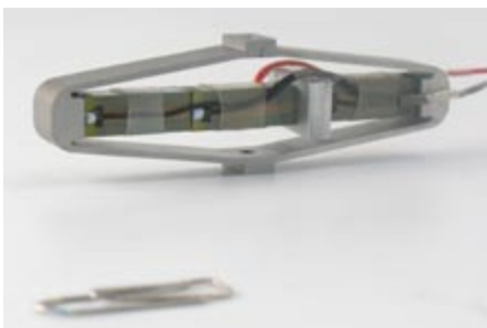
Figure 4.10: View of the APA 400MML actuator

Available option(s): SG, VAC, HT Available interface option(s): FI, H, TH, FF, SI