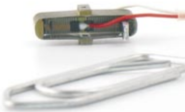
Figure 4.4: View of the APA 150XXS Actuator

Available option(s): VAC Available interface option(s): FI, SI