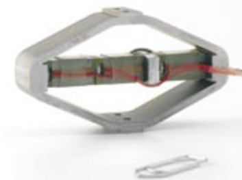
Figure 4.11: View of the APA 120ML Actuator

Available option(s): SG, VAC, HT Available interface option(s): FI, H, TH, FF, SI