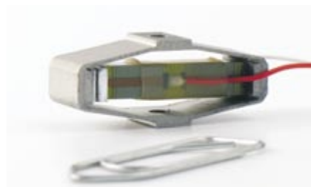
Figure 4.7: View of the APA 60SM actuator

Available option(s): SG, VAC, HT Available interface option(s): FI, H, TH, SI