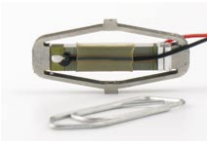
Figure 4.6: View of the APA 60S actuator

Available option(s): SG, NM, VAC, HT, TC (except 120S) Available interface option(s): FI, H, TH, SI