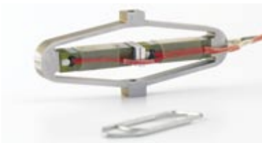
Figure 4.8: View of the APA 150M Actuator

Available option(s): SG, NM, VAC, HT Available interface option(s): FI, H, TH, FF, SI