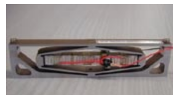
Figure 4.2a : Single blade guided Amplified Piezoelectric Actuator APA™