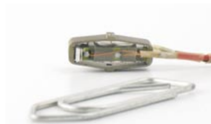
Figure 4.5: View of the APA 35XS Actuator

Available option(s): SG (except 50XS), NM, VAC Available interface option(s): FI, H, TH, SI