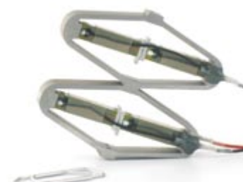
Figure 4.3 : Twin Amplified Piezoelectric Actuator APA™