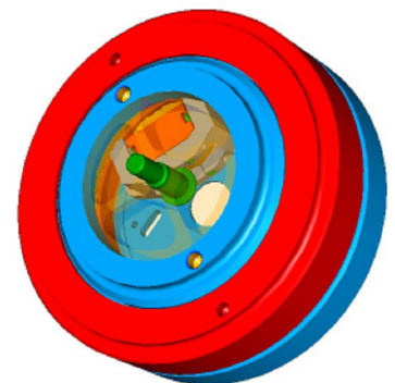
RPA motor - CAD view.