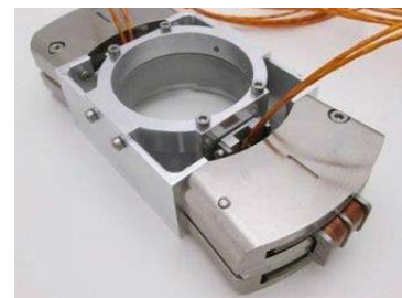
CTEC Scan Mechanism Motor Engineering Model (MTG)