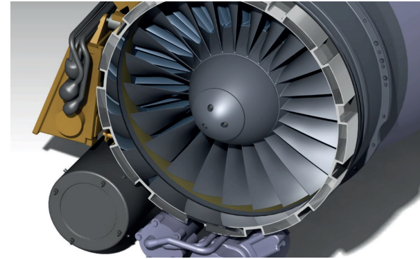
Fig. 1: Overview of the aircraft engine where PJA will be integrated.

The objective is to develop 8 PJA that can provide a sonic jet with a mass flow of 30 g/s for each one. The upstream pressure needs to be defined whereas the downstream pressure is 0.7 bar.