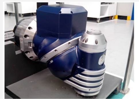
Fig3: Active Duty Heavy Spindle / Electromagnetic inertial actuator