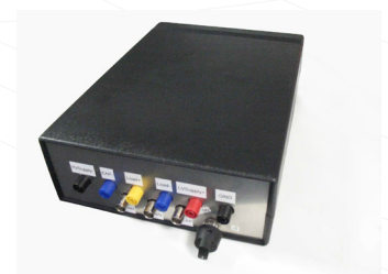
Fig. 4: Electronic for EAP driving (max 3kV)