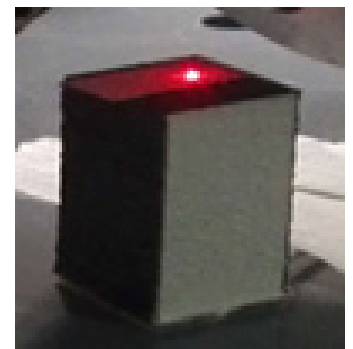
Fig. 2: Focus on EAP : SXT1A-1520