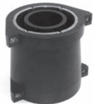
Fig. 2: Space Voice Coil 2 (stator shown only) for IASI Interferometer for CSEM