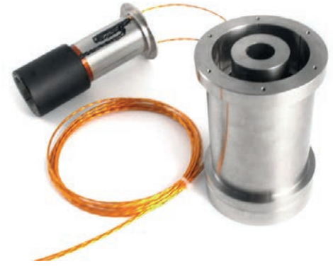
Fig. 3: Space Voice Coil 3