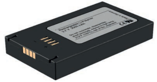
Fig. 1: 3.7V, 2000mAh, lithium-polymer battery cell.

The regulated voltage levels are generated from the battery power source using DC/DC converters, which can decrease, elevate, or invert the input voltage from the batteries. This means that almost any output voltage can be built from the battery source, using those specific topologies. The DC/DC converters exhibit very high