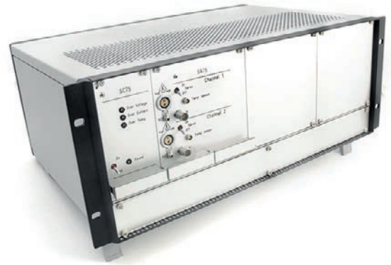
Fig. 1: Switching Amplifier SA75D

These COMPACT, DYNAMIC & PRECISE SA75X piezo drivers are adapted to air & space applications (as well many other applications) when driving large piezo actuators with low volume & low power consumption is required. Another advantage of the SA75X is its high power-to-mass ratio and its very high efficiency. The output reactive power is 10 times larger the input power. This is due to its switching topology and its intrinsic energy recovery.