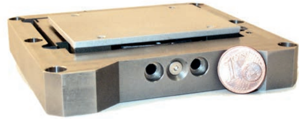
Fig. 1: Views of the Electrically Tuneable Suspension

All performances are given for an isolated mass of 100g corresponding to the mobile interface without payload. The added isolated device weight will have a positive effect on the Electrically Tuneable Suspension performances.