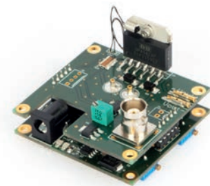
Fig. 2: View of the CLAu10