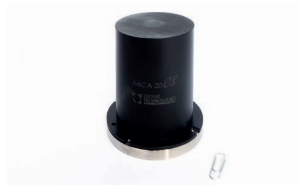
Fig. 1: View of the MICA20CS in proof-mass configuration (MICA20CS actuator + counter-mass + back position sensor)

Eu Project MC-SUITE (680478) has funded a part of this development.