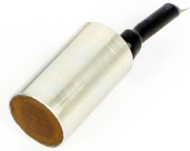
Fig. 1: View of the LES1000 proximity sensor

The performances are summarised in the Table 1.